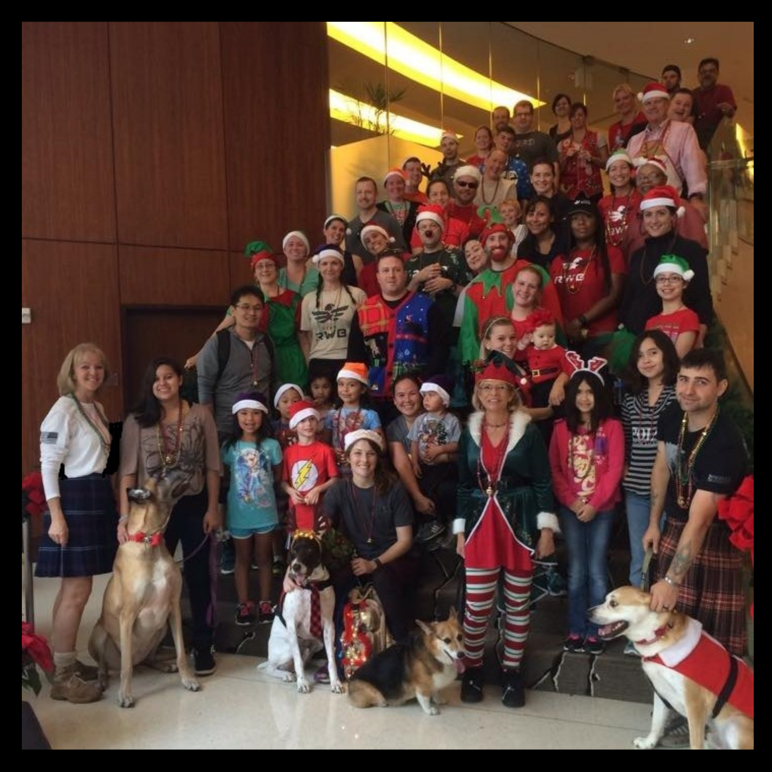
The Lord Fairfax Silver Chapter hosted a Jingle Bell Jog on December 13, 2105 to raise money for Veteran Service Organizations! We enjoyed the costumes, the kids and the pets!!