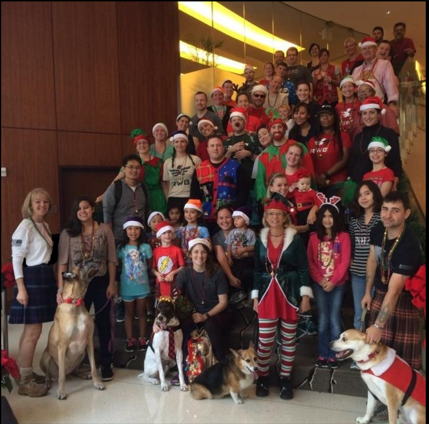
The Lord Fairfax Silver Chapter hosted a Jingle Bell Jog on December 13, 2105 to raise money for Veteran Service Organizations! We enjoyed the costumes, the kids and the pets!!